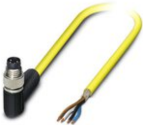
Sensor/actuator cable, 4-position, PVC, yellow, shielded, Plug angled M8, on free cable end, cable length: 10 m

Please be informed that the data shown in this PDF Document is generated from our Online Catalog. Please find the complete data in the user's documentation. Our General Terms of Use for Downloads are valid ( http://phoenixcontact.com/download )