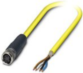
Sensor/actuator cable, 4-position, PVC, yellow, shielded, free cable end, on Socket straight M8, cable length: 2 m

Please be informed that the data shown in this PDF Document is generated from our Online Catalog. Please find the complete data in the user's documentation. Our General Terms of Use for Downloads are valid ( http://phoenixcontact.com/download )