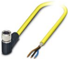
Sensor/actuator cable, 3-position, PVC, yellow, shielded, free cable end, on Socket angled M8, cable length: 10 m

Please be informed that the data shown in this PDF Document is generated from our Online Catalog. Please find the complete data in the user's documentation. Our General Terms of Use for Downloads are valid ( http://phoenixcontact.com/download )