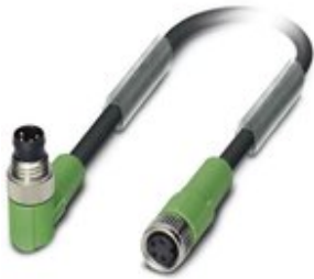
Sensor/actuator cable, 4-position, PVC, black RAL 9005, Plug angled M8, on Socket straight M8, cable length: 3 m

Please be informed that the data shown in this PDF Document is generated from our Online Catalog. Please find the complete data in the user's documentation. Our General Terms of Use for Downloads are valid ( http://phoenixcontact.com/download )