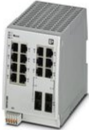
Managed Switch 2000, 14 RJ45 ports 10/100 Mbps, 2 SC single mode 100 Mbps, PROFINET Conformance-Class B

Please be informed that the data shown in this PDF Document is generated from our Online Catalog. Please find the complete data in the user's documentation. Our General Terms of Use for Downloads are valid ( http://phoenixcontact.com/download )