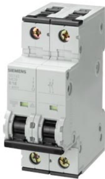
MINIATURE CIRCUIT-BR. 400V 10KA, 2-POLE, C, 40A FOR RAILWAY APPLICATIONS