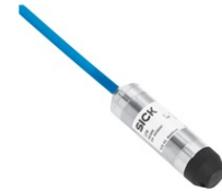
Product may differ from illustration